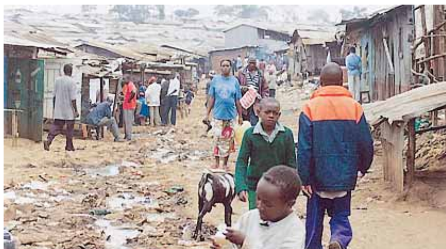
Kibera's streets are characterized by uncollected garbage and clogged drainage channels

The high population density, unplanned and crowded housing, and lack of infrastructure have resulted in poor provision of environmental and social services. Most roads in Kibera are inaccessible to vehicles, drainage