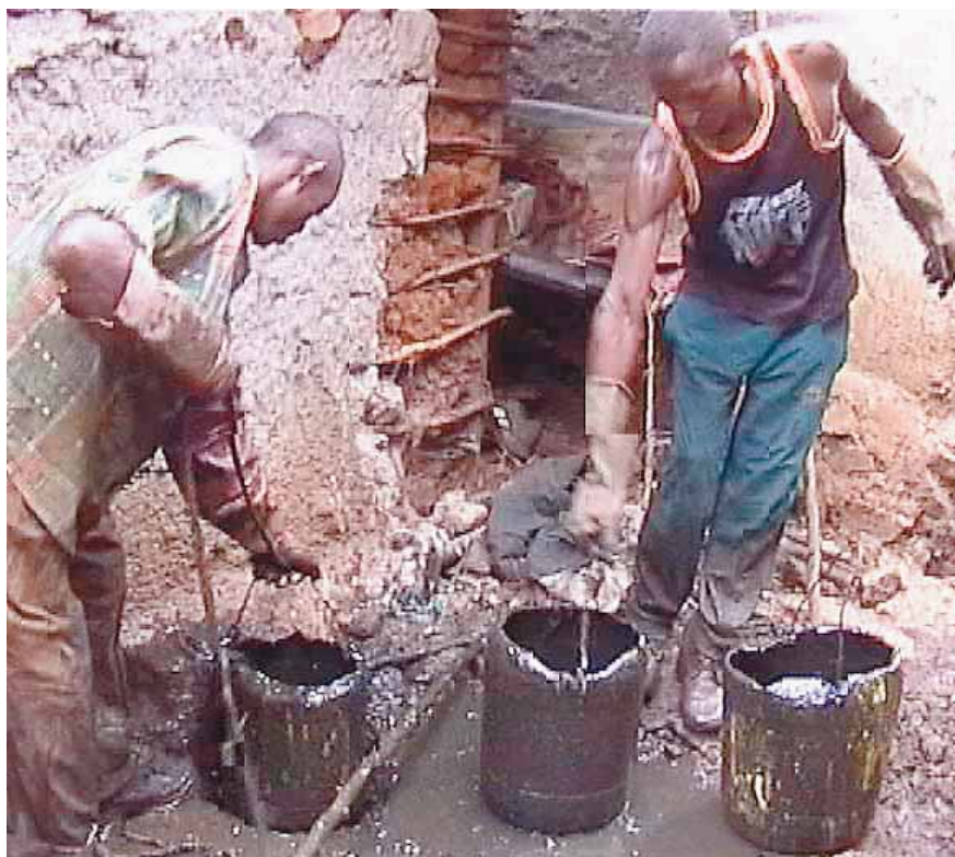
Manual pit emptiers at work

Manual emptying will remain as a necessary method for exhausting pit latrines for as long as vehicle access is limited in Kibera.