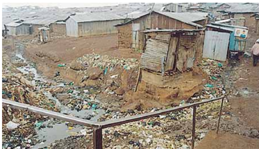
Gravitational emptying is common where a pit latrine is located next to river

emptying is a seasonal activity with peak periods corresponding to rainy seasons, when the sludge is washed away by rainwater. Manual and gravitational emptying are compromise solutions to the sanitation problems of Kibera. They enable the residents to clear their latrines but with adverse consequences for health and the environment. Improper excreta disposal is a major health risk and contaminates the river water. Blocked drains and heaps of uncollected garbage are unsightly, unpleasant and provide breeding sites for mosquitoes and flies.