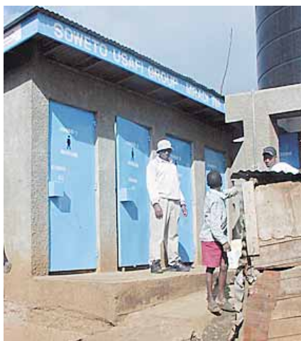
A public latrine funded by an NGO

As Table 1 illustrates, municipal authorities neither own nor manage public latrines in Kibera. All but one of the 20 toilet blocks have been constructed using donor or NGO