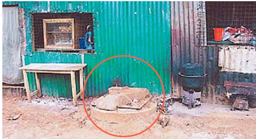
A food kiosk located next to a sewer manhole, rendering it inaccessible

Since 1998 licences have been issued to private operators (see Table 5) allowing them to carry out mechanical emptying and discharge the sludge into the city's sewerage network since the treatment plants are far from the city center. In 1999, only three private providers were operating in Nairobi. Five years later, there are about 30 operators, of which 10 are licensed. These private operators compete with five mechanical emptiers subsidized by the municipality or development organizations. This practice of issuing licenses, combined with the lack of a reliable public service, has confirmed the role that the private sector has been able to play in service provision.