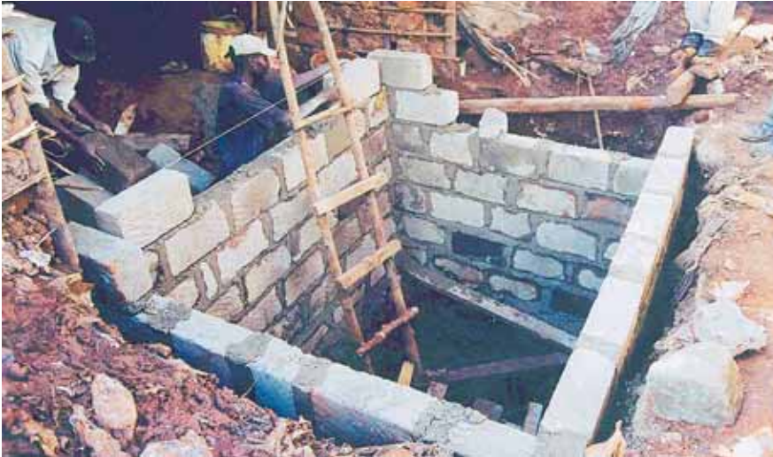
Construction of a partially funded private latrine

than in more remote and equally overcrowded areas.