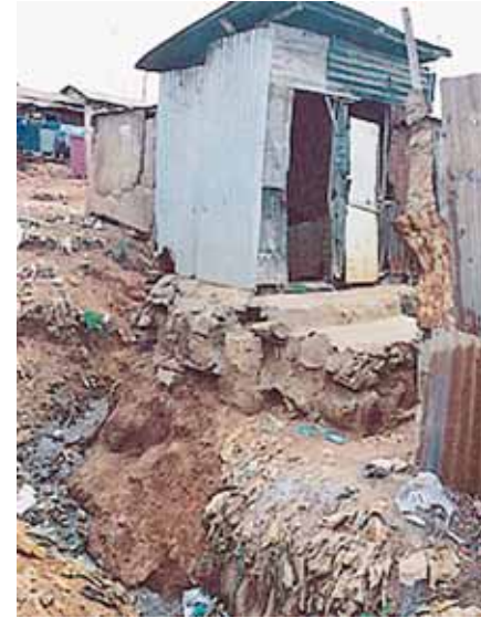
A typical pit latrine in Kibera

These services are mostly offered by independent SSPs who are resident in the settlement and can deliver what public services are unable or unwilling to provide. Alternative providers