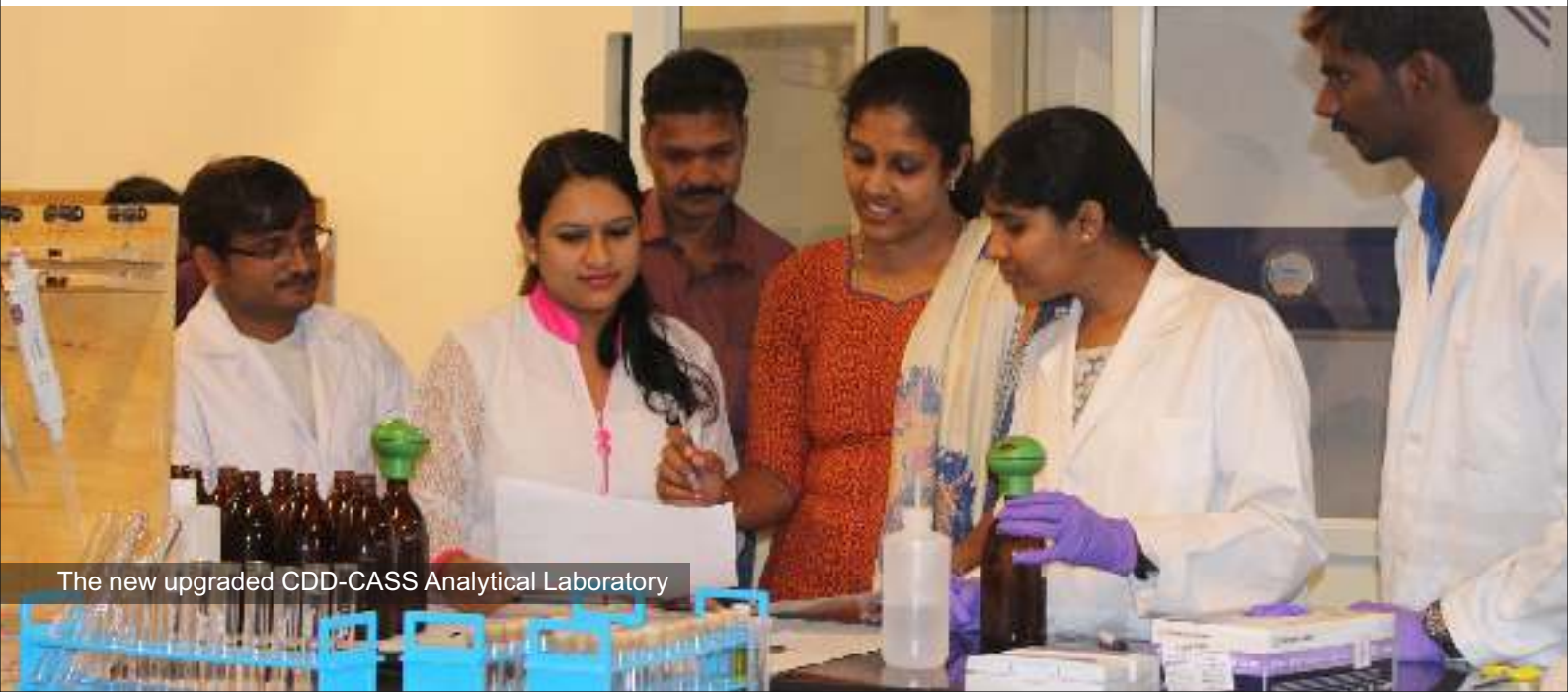
The new upgraded CDD-CASS Analytical Laboratory