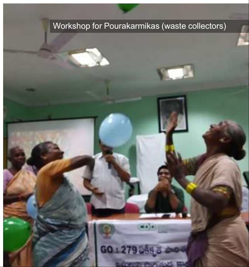
Workshop for Pourakarmikas (waste collectors)

We received this contract towards the end of this financial year and progress on this project will be made in the coming financial year.