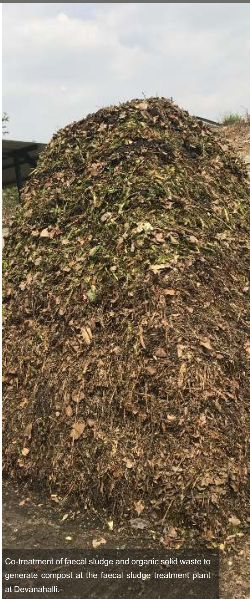
Co-treatment of faecal sludge and organic solid waste to generate compost at the faecal sludge treatment plant at Devanahalli.

FY2017-18 (31 December, 2017) saw the closure of phase 5 of the BMZ funded Basic Needs Services project as well as the closure of the BMZ funded Nexus project.