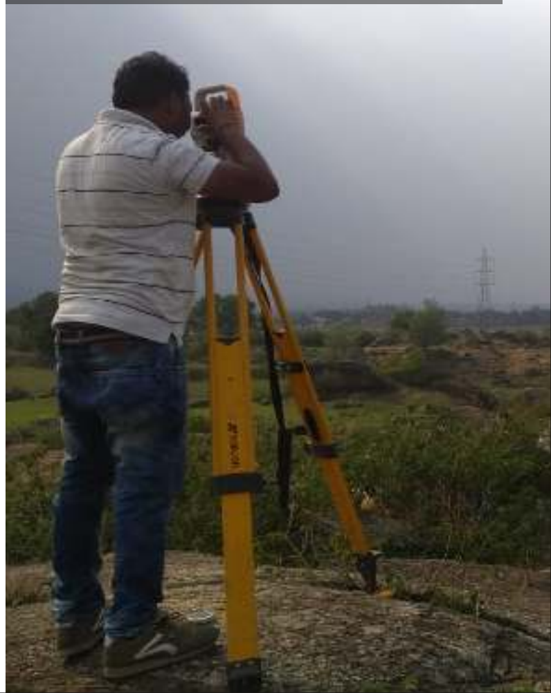
Topo survey & soil test being conducted in the town, Gumla

The project will ensure that 26 towns of Jharkhand have a sustainable septage management system in place, which are contextualised, durable and adaptable to the way the town grows as every town or city does in a developing country.