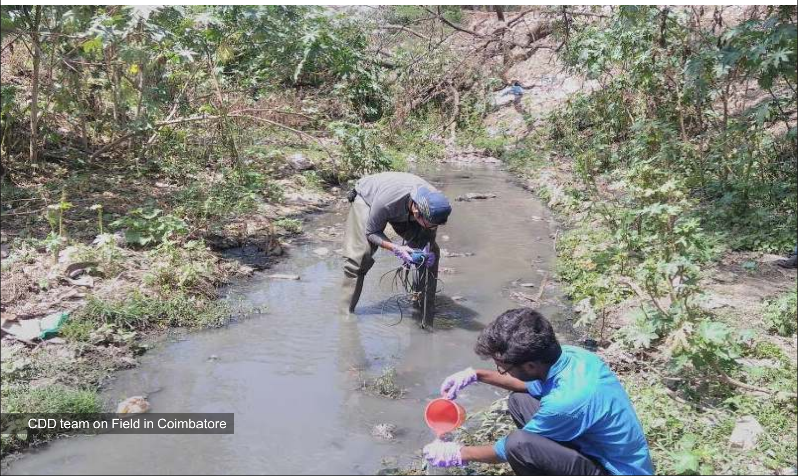
CDD team on Field in Coimbatore

We ended the year with: Water balance analysis completed for all the 8 lakes in Coimbatore. Preparation of EIA report, final masterplan for the last 4 lakes and Hydrogeology studies in progress.