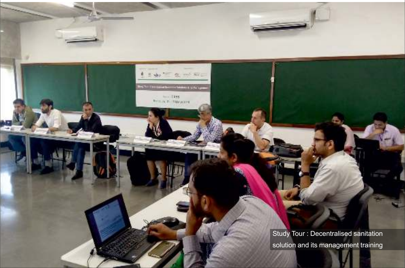
Study Tour : Decentralised sanitation solution and its management training