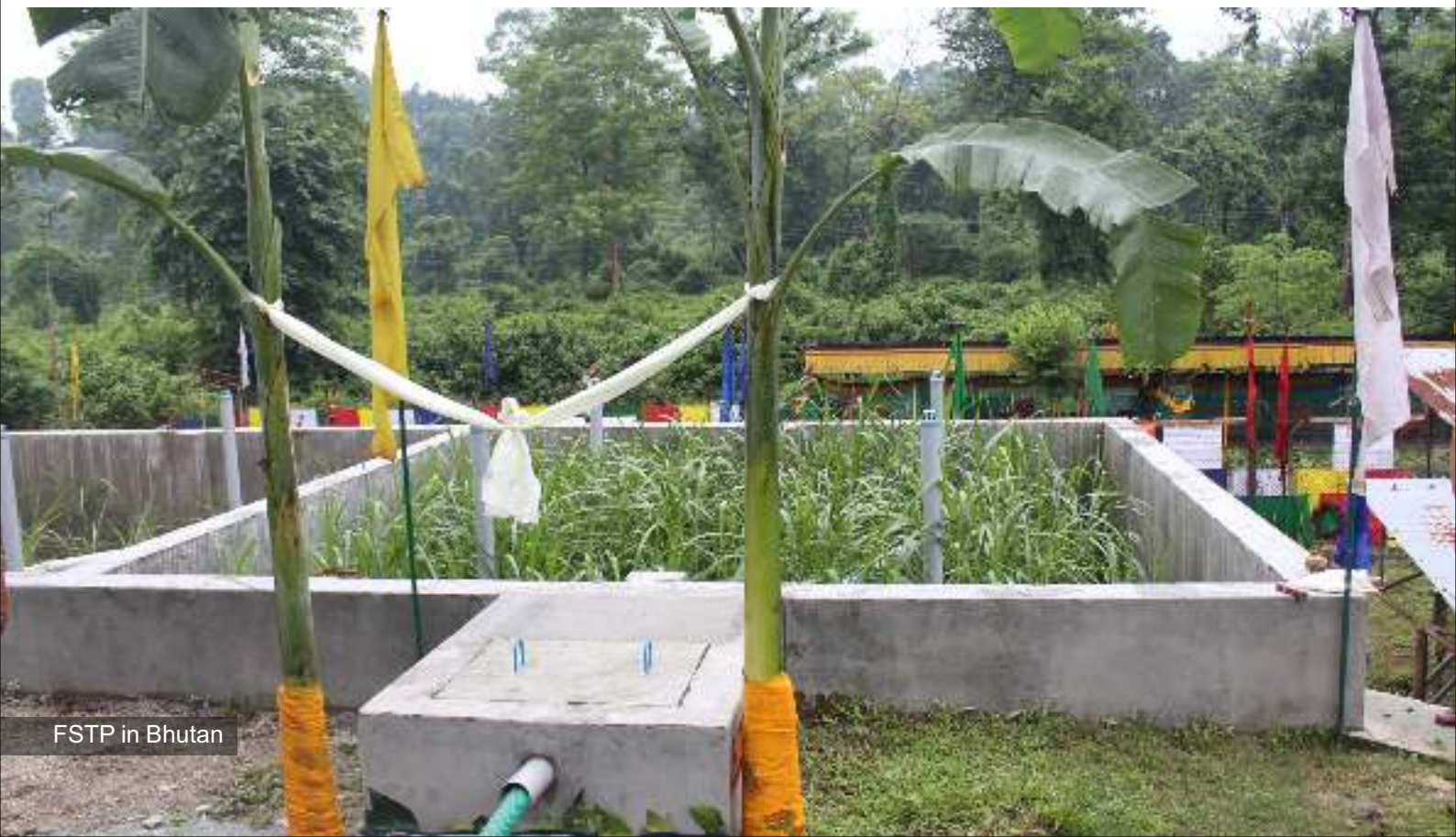
FSTP in Bhutan

With Samste, Bhutan now has a replicable model that other towns/cities can emulate – a pivotal move as the country is currently developing detailed plans for each of its towns.