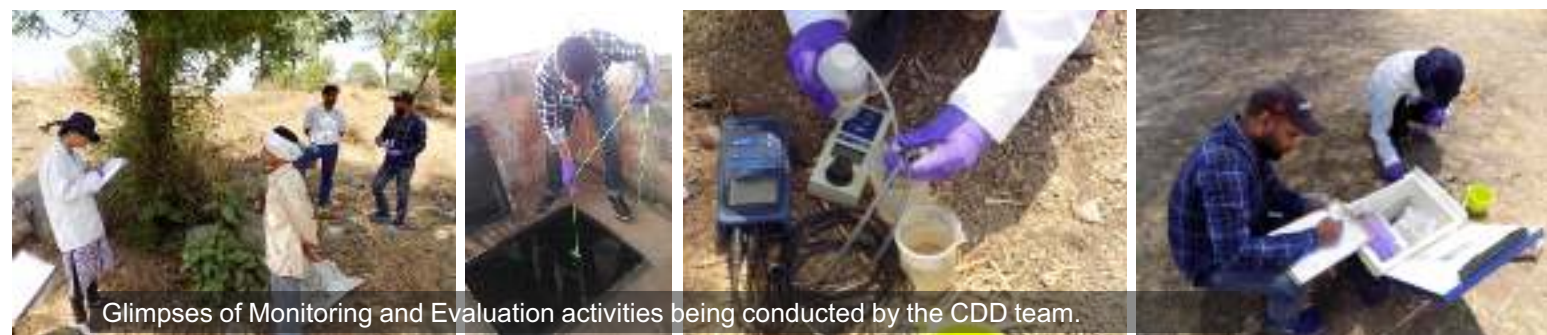
Glimpses of Monitoring and Evaluation activities being conducted by the CDD team.

Major challenges faced were accessibility to site and sampling at different modules because of lack in maintenance.