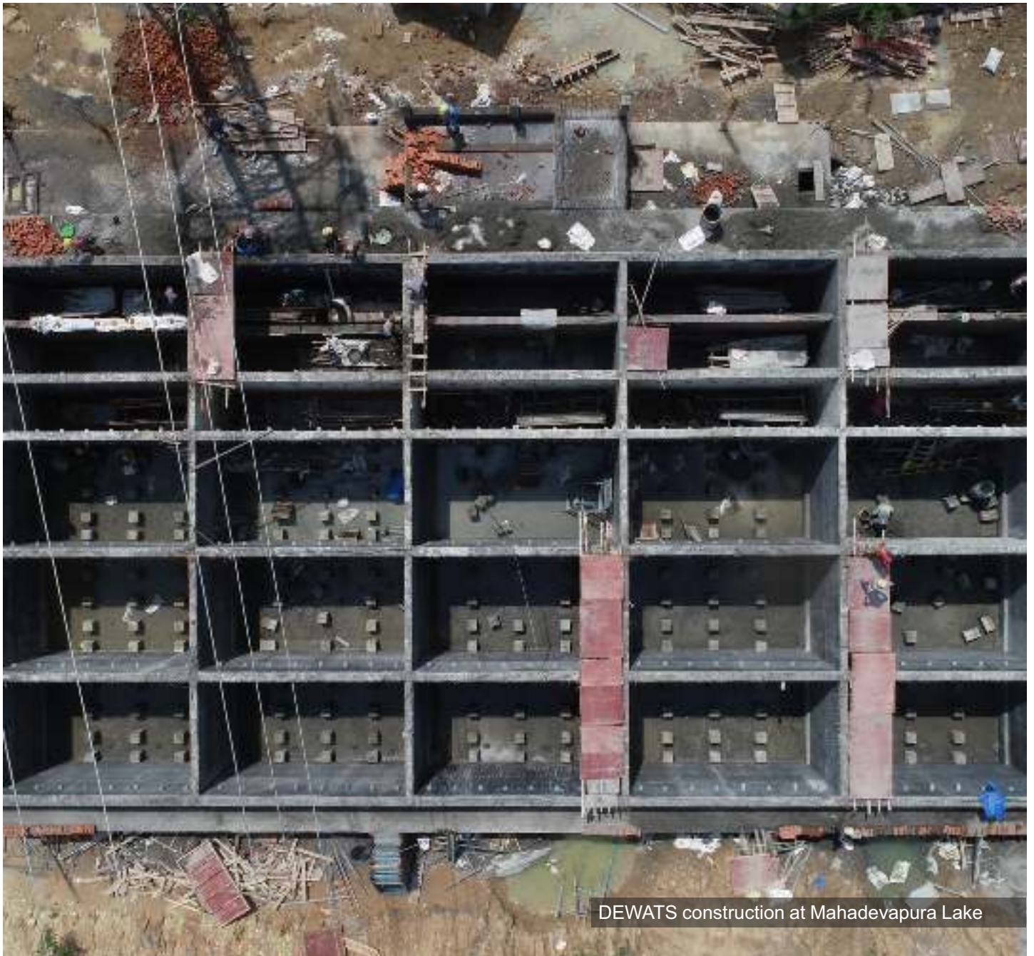
DEWATS construction at Mahadevapura Lake

(d) Alleppey For rejuvenating the canal network of Alleppey which are plagued by poor solid and liquid waste management, a pilot project has been launched by CDD for a 250m stretch of one of the canals. The objective of this approach is to develop a natural and decentralized solution for the situation. We ended the year with: Cleaning of drains begins. 40 Alleppey council members visited the Bangalore office to understand FSTP processes and the working of DEWATS. Studies of site conditions and testing of water samples have been carried out. Concept note for treatment strategy has been submitted.