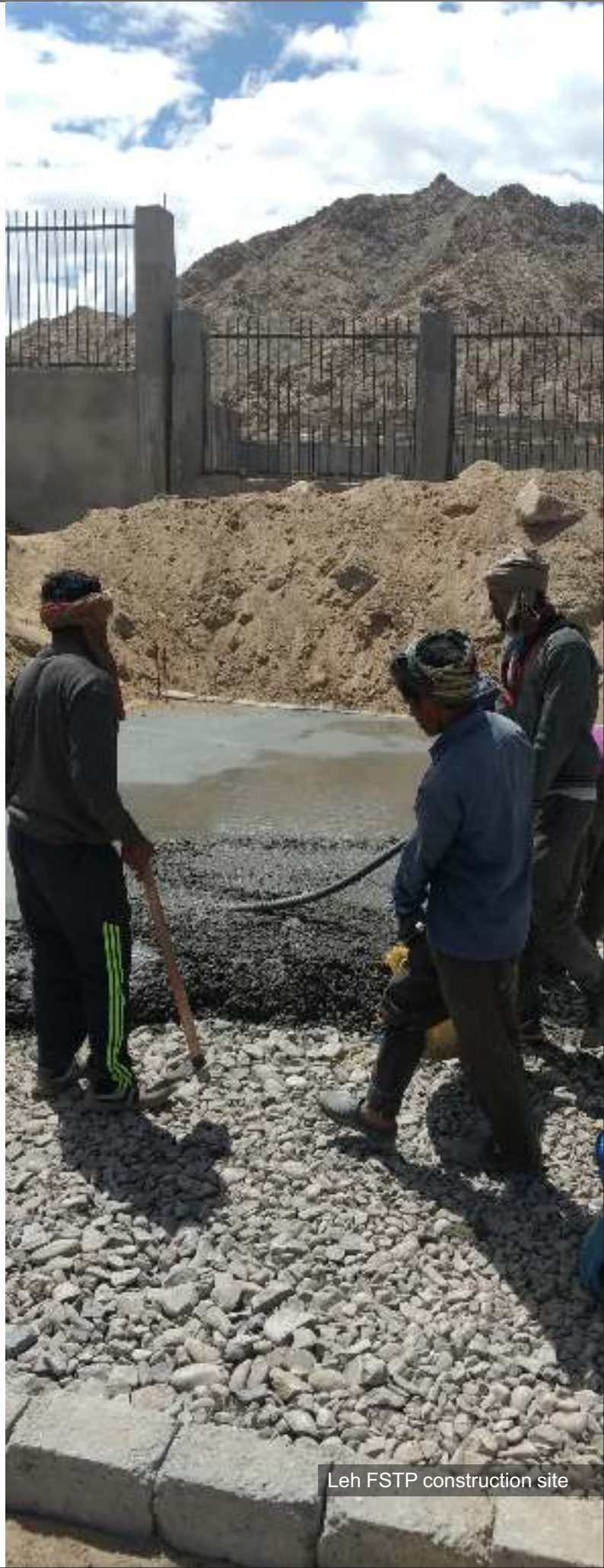
Leh FSTP construction site

FSM has helped Leh put in place a quick and affordable solution – helping prevent potentially serious health and economic consequences. We hope that the Leh model of FSM will be a good example for other towns looking for similar solutions.