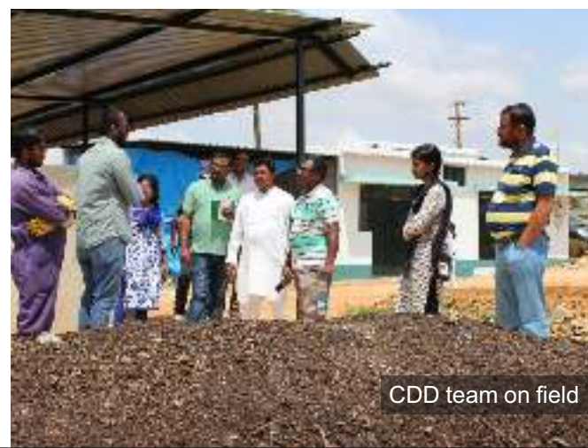
CDD team on field