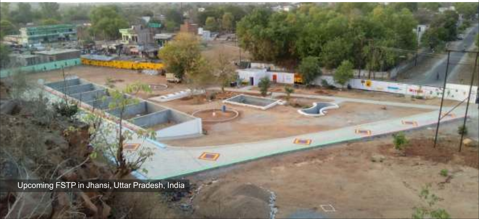
Upcoming FSTP in Jhansi, Uttar Pradesh, India

With this faecal sludge treatment plant, CDD Society has helped Jhansi to upgrade its situation in providing improved sanitation service to its citizens.