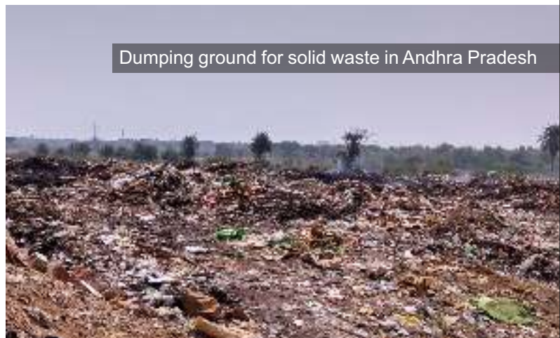
Dumping ground for solid waste in Andhra Pradesh

The learnings from both these projects were used in another major project: hand-holding the BORDA-Afghanistan team in the preparation of a model integrated sanitation plan for an unplanned settlement in the city of Kabul, Afghanistan. Support was provided through all the stages of the project: baseline assessment (including 100% household surveys and stakeholder interviews), gap analysis and formulation of an action plan. As a part of this project, training was delivered in Kabul to bureaucrats and government officials on the process of citywide sanitation planning. The project has been successfully completed.