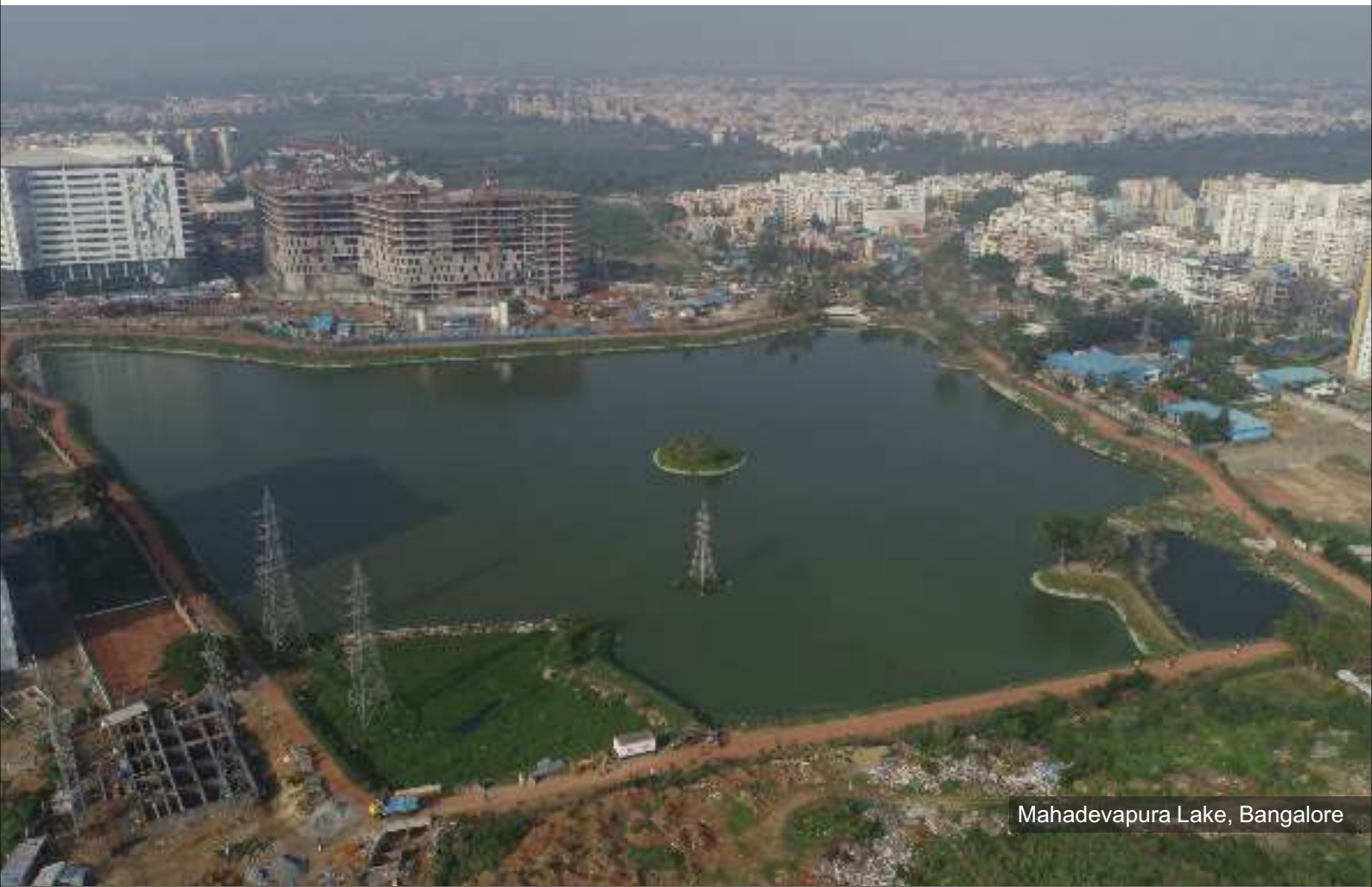
Mahadevapura Lake, Bangalore

We ended the year with: Upstream earthen drain and diversion structure commissioned. Concreting of treatment plant walls completed.