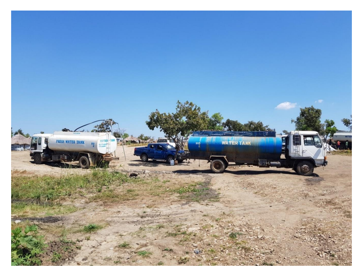
Figure 1: Water Trucking in Zone 3, BidiBidi in Kululu SC Yumbe District (Dec. 2017)

The inadequate water supply was supplemented by trucking water from far off distances. By October 2017, 81% and 37% of water supplied to Imvepi and Rhino settlements respectively in Arua was by trucking. More than 33% of water delivered in Palorinya settlement in Moyo, BidiBidi in Yumbe and Palabek in Lamwo was by trucking. It should be noted that currently, refugees do not pay for water services provided within the settlements.