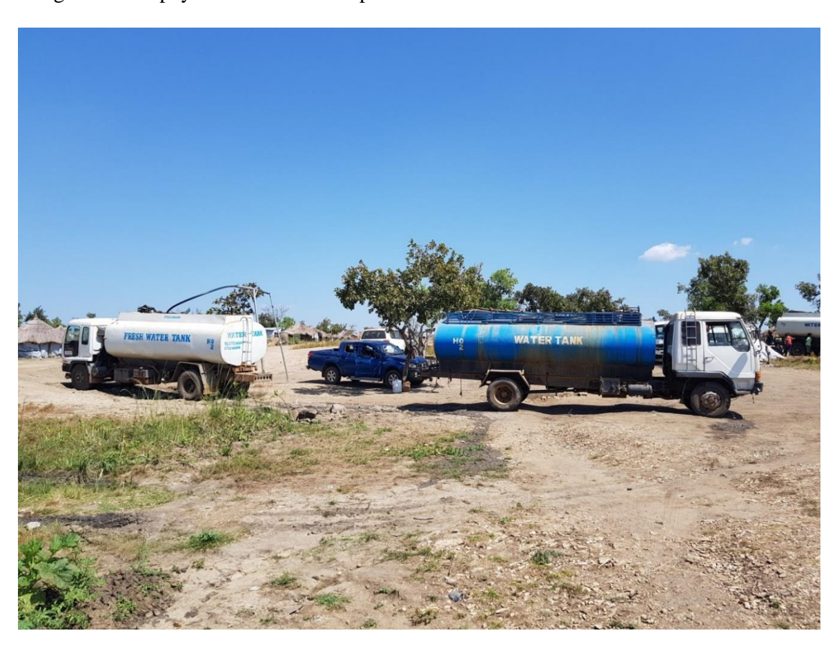
Figure 1: Water Trucking in Zone 3, BidiBidi in Kululu SC Yumbe District (Dec. 2017)

The inadequate water supply was supplemented by trucking water from far off distances. By October 2017, 81% and 37% of water supplied to Imvepi and Rhino settlements respectively in Arua was by trucking. More than 33% of water delivered in Palorinya settlement in Moyo, BidiBidi in Yumbe and Palabek in Lamwo was by trucking. It should be noted that currently, refugees do not pay for water services provided within the settlements.