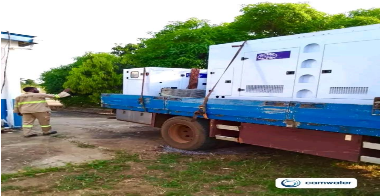
Figure 3: Installation of the Generator Set

This generator is part of a large stock of equipment recently acquired and deployed in several other factories, including in Eséka, Makak and Mfou.