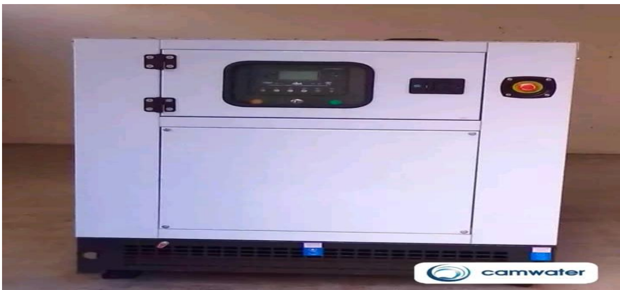
Figure 2: Acquisition of the Generator Set

Many efforts of the CAMWATER-Regional Delegation of the Centre (DRC), with the installation of the 75 KVA generator set at the Monatéle plant on Wednesday, December 11, 2024,