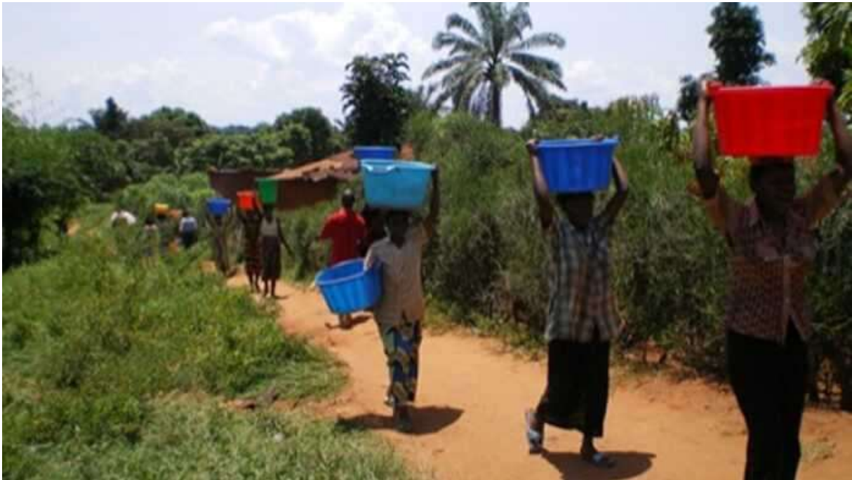
Figure 3: Population of NKODABEL leaving the drinking water supply point

connection requests of the populations of the Evodoula District and its surroundings to facilitate access to drinking water and sanitation services.