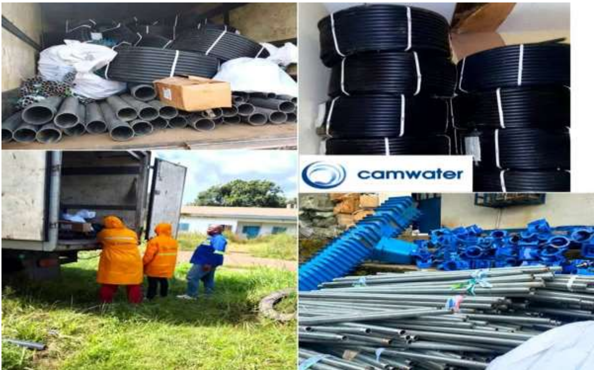
Figure 2: Connection equipment to CAMWATER's water distribution networks

NKODABEL is a village located 5 KM south of the district of Evdoula, department of Lekié, Centre region, Cameroon.